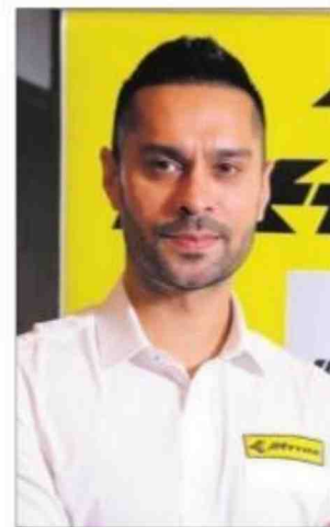
Gaurav Gill (motorsports)