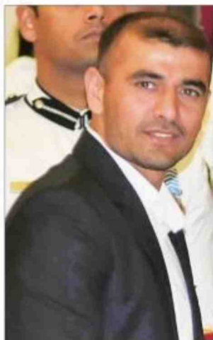
Ajay Thakur (kabaddi)