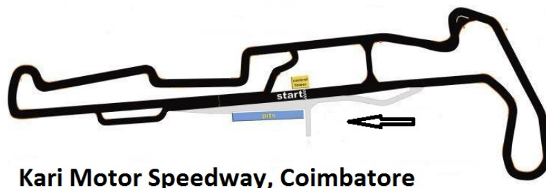
Kari Motor Speedway, Coimbatore