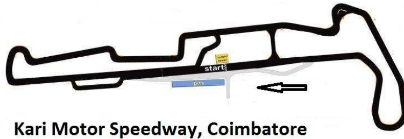
Kari Motor Speedway, Coimbatore